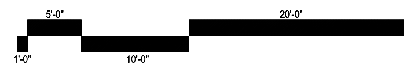
01 AS-BUILT FLOOR PLAN SCALE: 3/16" = 1'-0"

SHEET NAME: AS-BUILT FIRST FLOOR PLAN SHEET NUMBER: A300